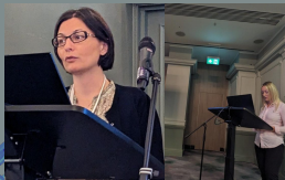
CaHRU studies presented at 51st Society of Academic Primary Care Annual Scientific Meeting in Brighton in July 2023